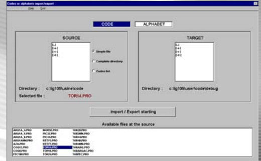
New decoder export to real time technical analyzer library (ex TRC641 or TRC8050)